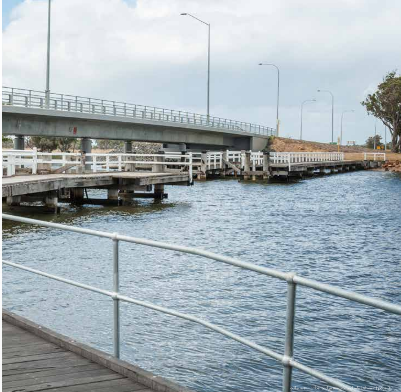
collie river - timber bridge removal and refurbishment | page 3